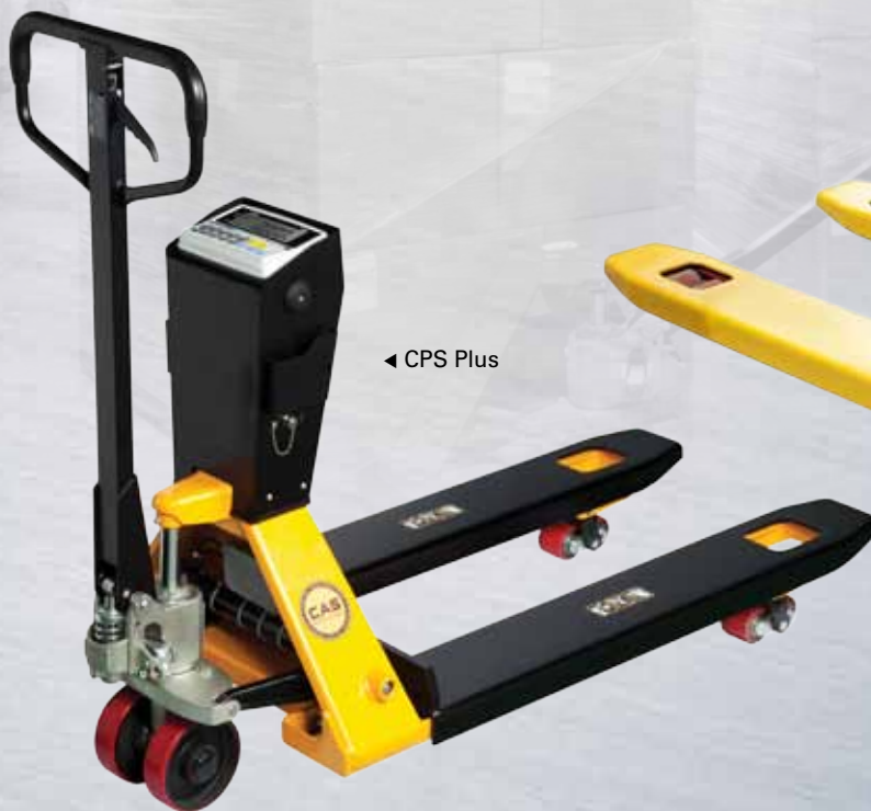
◀ CPS Plus