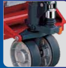
Non-marking Polyurethane Steer & Load Wheels