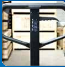
Ergonomic Loop Handle