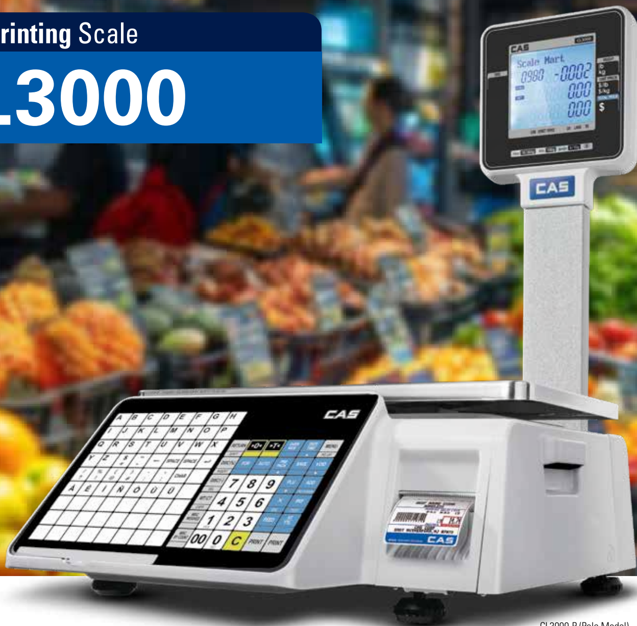
CL3000-P (Pole Model)