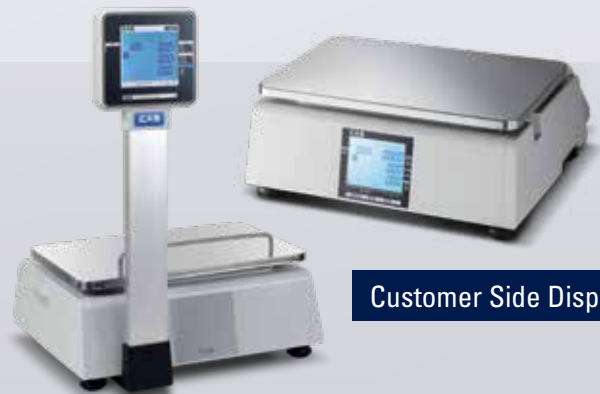
Customer Side Displays