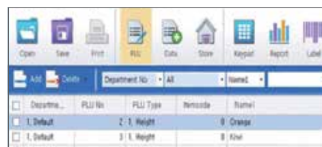
Easy Programming with CL Works Pro!