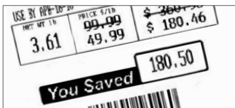
Customize Your Product Labels