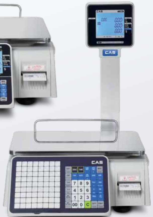
CL3000-P (Pole Model)

In addition to the PLU Keys, the CL3000 includes 35 Function Keys (36 on the Pole Model). Use these keys to for easy access to changing label formats, accessing settings, or performing other functions.