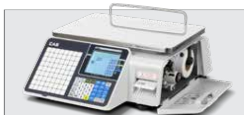
Easy to Load Labels