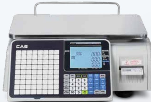
CL3000-B (Bench Model)

72 Direct & 72 Indirect PLU keys 35 Function Keys for CL3000-B 36 Function Keys for CL3000-P