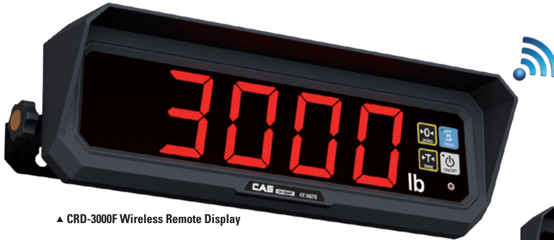
▲ CRD-3000F Wireless Remote Display