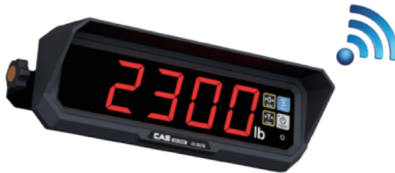
▲ CRD-2300F Wireless Remote Display