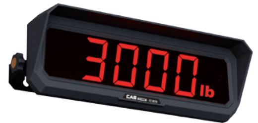
▲ CRD-3000 Wired Remote Display